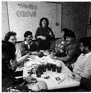
Job training for Saturn manufacturing team members means 700 hours of hands-on technical training (far left) and classroom work in "soft" skills such as creative thinking and conflict management (left). Saturn sales consultants attend seminars and complete self-study sales training modules to learn about Saturn's sales philosophy, which aims to create an environment of mutual trust (below). Much of the training takes place at Saturn's training facility in Spring Hill, Tennessee, site of the company's manufacturing center.