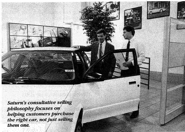
Saturn's consultative selling philosophy focuses on helping customers purchase the right car, not just selling them one.