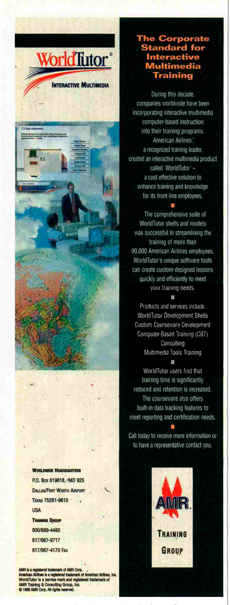
Circle No. 111 on Reader Service Card