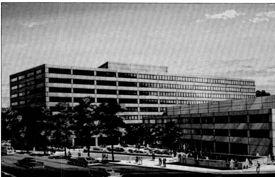
Architect's drawing of Capital Gallery, housing ASTD's new headquarters, shows the entrance to the L'Enfant Plaza Metro Station, located directly adjacent to the building at the corner of 7th Street and Maryland Avenue.