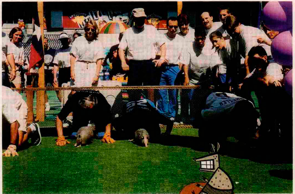
Anything "butt" typical employees of Omni hotels blow on their armadillos rumps to get them to cross the finish line first.

Top illustration by Bob Daly Illustration by Cyril Cabry