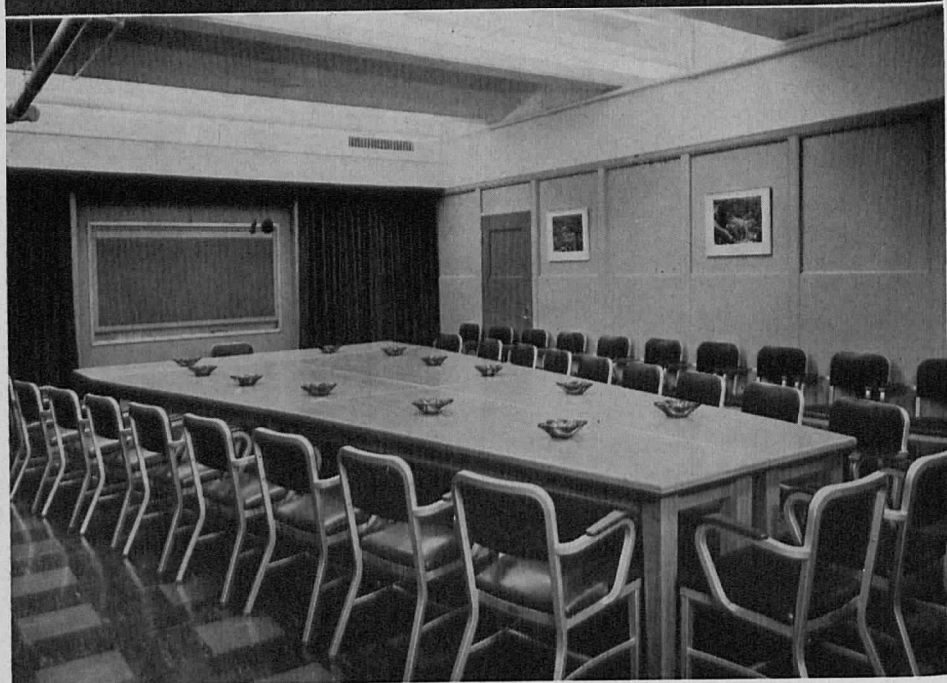
TOP: FIGURE 1. BOTTOM: FIGURE 2.