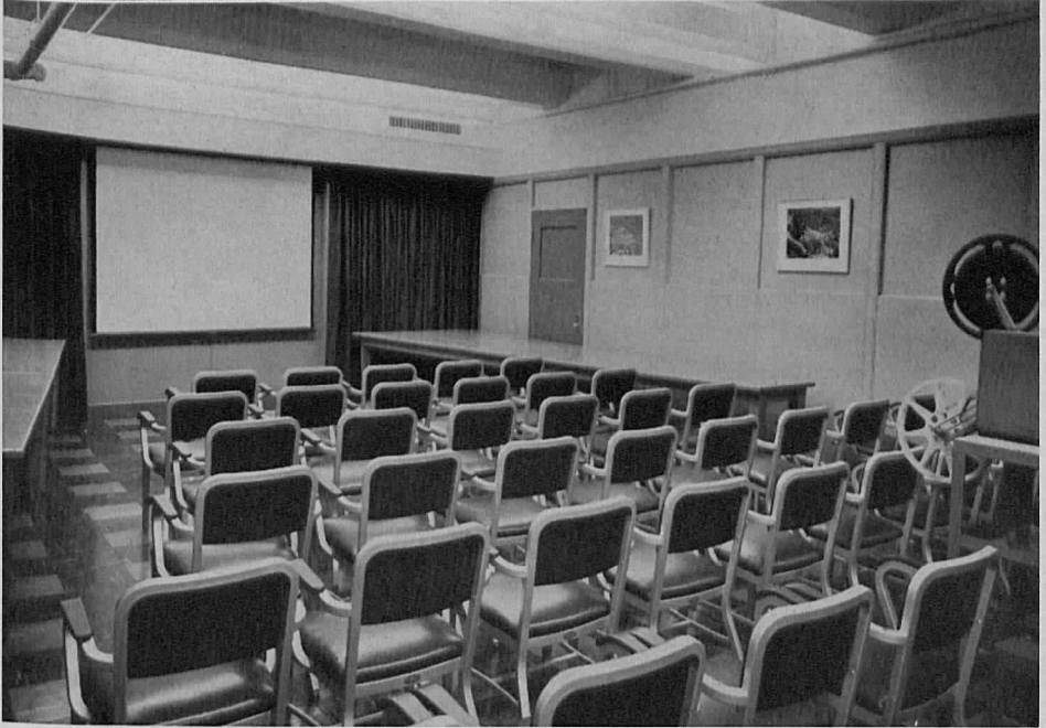
TOP: FIGURE 3. BOTTOM: FIGURE 4.