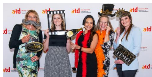
Team Bonding & Fun Celebrating

For more information, reach out to axis@tddallas.org regarding the event or to sponsorship@tddallas.org about these sponsorship opportunities.