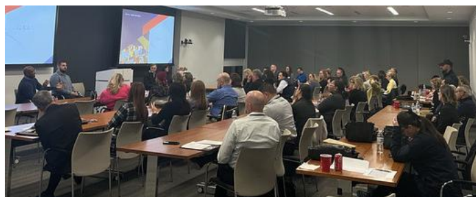
Chapter Meeting at Toyota