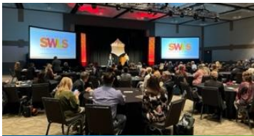
SWLS Main Stage

Southwest Learning Summit (SWLS) is a one-day conference for those who are passionate about learning and talent development in the workplace. Attendees come to elevate their knowledge and skills through the keynote and concurrent sessions while building their network with peers, innovators, and industry-changing vendors. Exhibition space is provided to SWLS sponsors to interact with the over 325 attendees. And all are encouraged to attend Happy Hour!