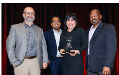
AXIS Awards Presentation