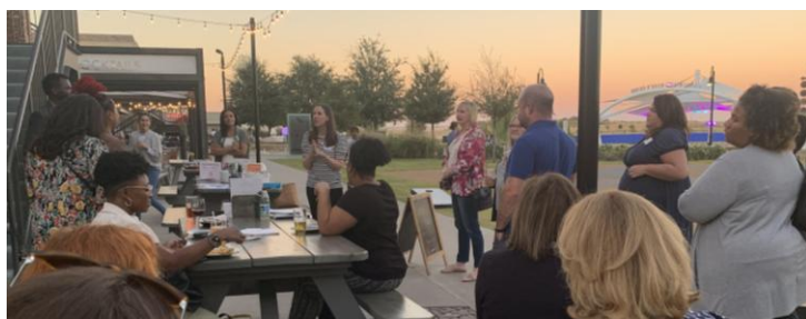
Happy Hour at The Flying Saucer