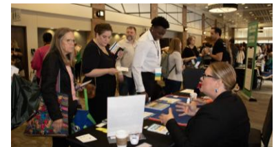
Exhibition in Main Hallway