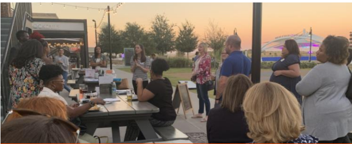
Happy Hour at The Flying Saucer