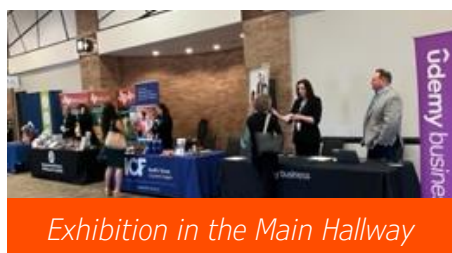
Exhibition in the Main Hallway