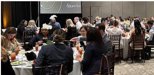
Professional Networking During Lunch

The AXIS Awards luncheon and awards presentation will take place on Tuesday, May 14, 2024 at the Plano Event Center. Find out more details at tddallas.org/AXIS .