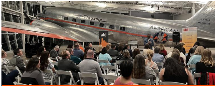
Chapter Meeting at American Airlines Museum