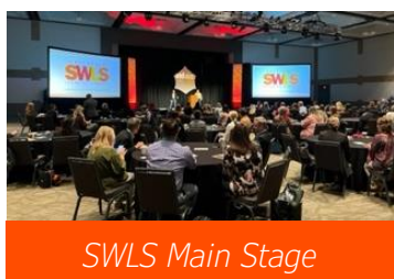
SWLS Main Stage

Other Sponsor Opportunities: Book - $2500 | Breakfast - $3000 | Lunch - $6000 | Happy Hour - $2000