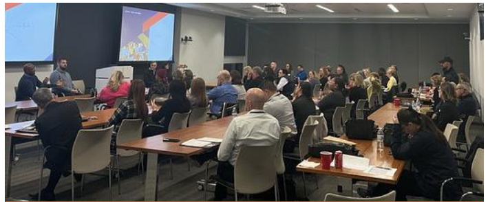
Chapter Meeting at Toyota