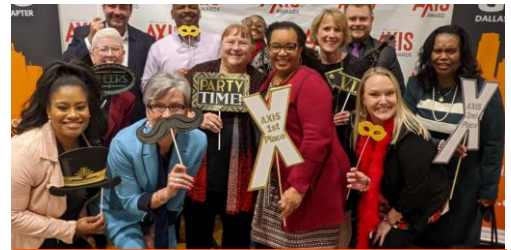
Team Bonding & Fun Celebrating

For more information, reach out to axis@tddallas.org regarding the event or to sponsorship@tddallas.org about these sponsorship opportunities.