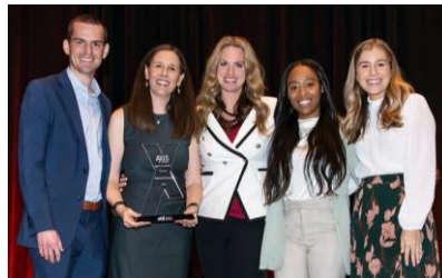
AXIS Awards Presentation