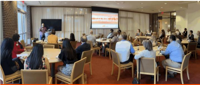
Chapter Meeting at SMU Cox School of Business